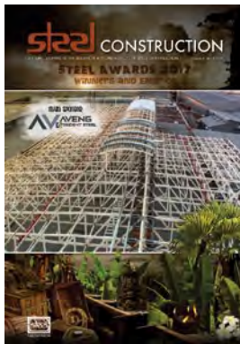
Front Cover: BMW H-EMS Roof Lift